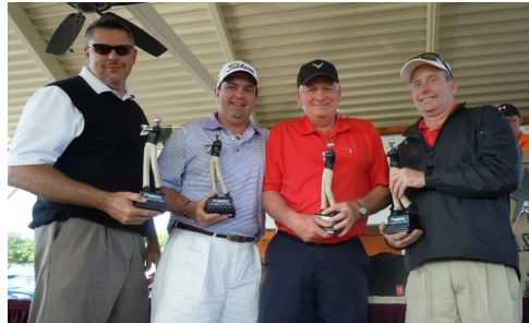
2013 Golf Classic