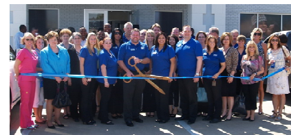
Ribbon Cutting ceremony