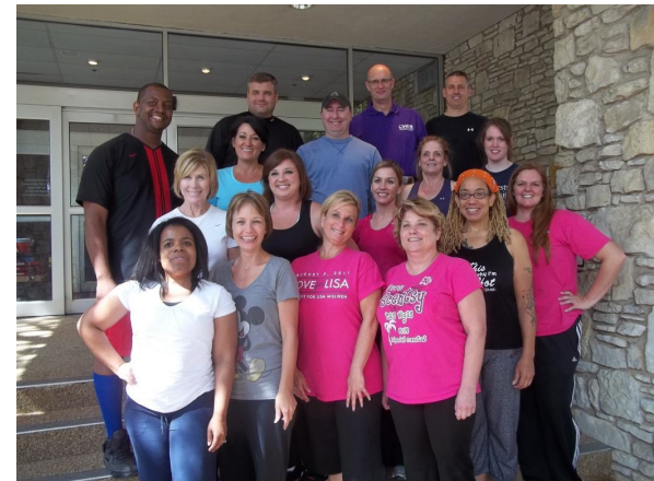
Leadership HEB 2013 Class